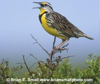
Eastern Meadowlark